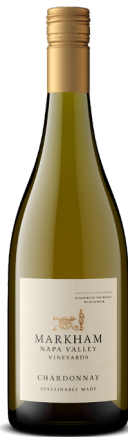
CHARDONNAY NAPA VALLEY