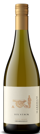
“SIX STACK” CHARDONNAY NAPA VALLEY